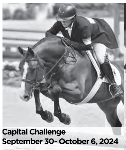
Capital Challenge September 30- October 6, 2024