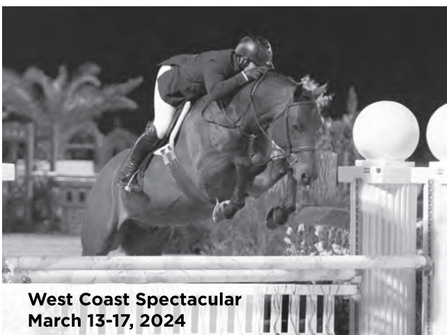
West Coast Spectacular March 13-17, 2024