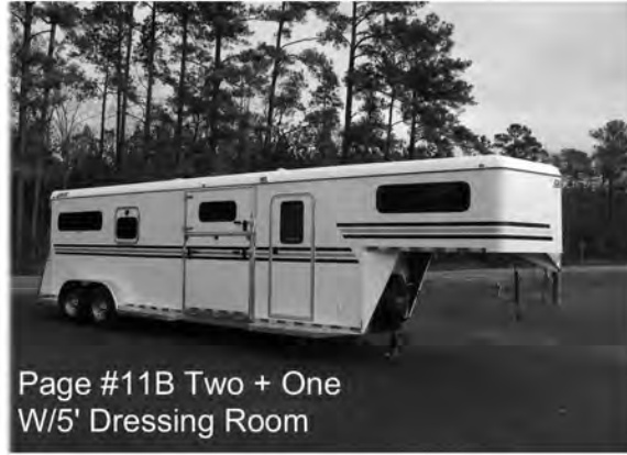
Page #11B Two + One W/5' Dressing Room