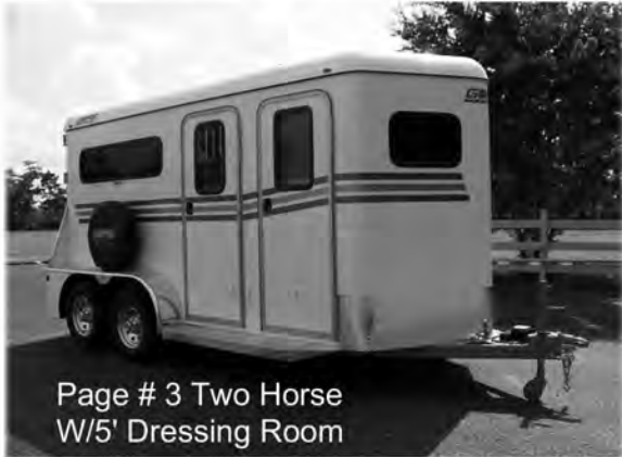
Page # 3 Two Horse W/5' Dressing Room