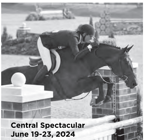
Central Spectacular June 19-23, 2024