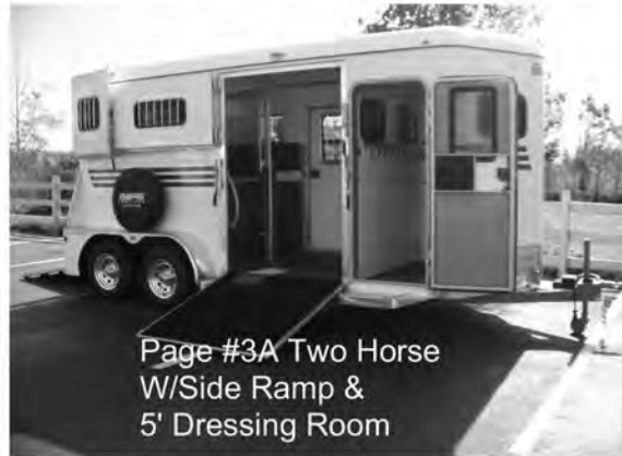
Page #3A Two Horse W/Side Ramp & 5' Dressing Room